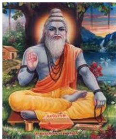
Ved Vyas Muni